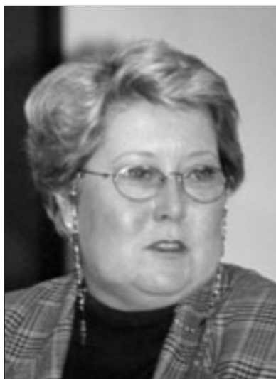
OKLAHOMA REPRESENTATIVE JARI ASKINS

A single minor infraction could decrease the likelihood of early release. “We need to implement an intermediate sanction.”