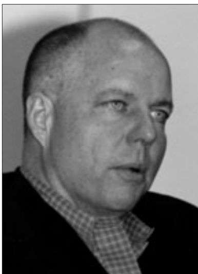
CONNECTICUT REPRESENTATIVE MICHAEL LAWLOR

“I’m as frustrated as anybody about the ineffectiveness of drug treatment programs. But isn’t it fair to ask, what’s the effectiveness of all this incarceration?”