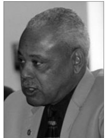
LOUISIANA SENATOR DONALD CRAVINS

"[The budget crisis] will cause us to do better with what we've got."