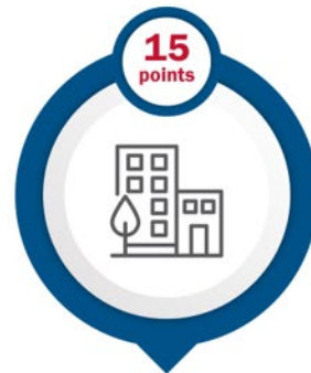
Subapplicant has Building Code Effectiveness Grading Schedule Rating of 1 to 5