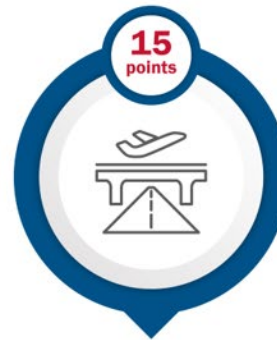
Mitigating risk to one or more lifelines