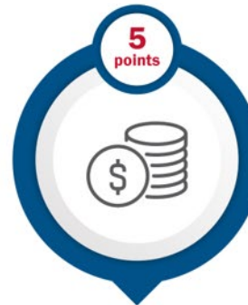
Increased non-federal cost share