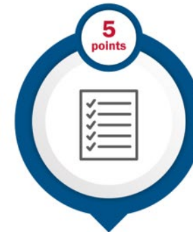
Designation as a small impoverished community