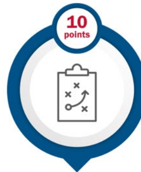
Application generated from a previous FEMA Hazard Mitigation Assistance Advance Assistance award