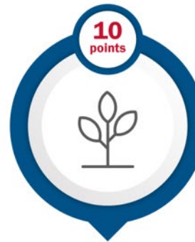
Incorporation of nature-based solutions