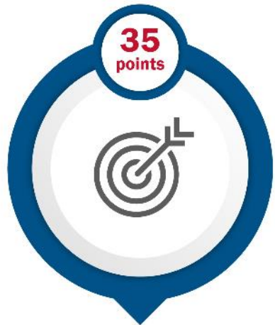
Risk Reduction / Resiliency Effectiveness