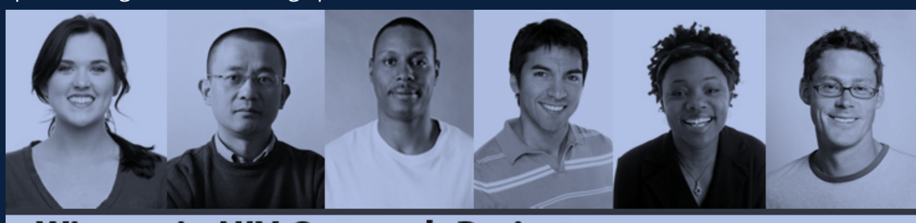
Wisconsin HIV Outreach Project

SAPG members, or ambassadors, are selected through a competitive application process. The 2022 ambassadors include: Ryan White C funded agencies, clinical providers, (including tribal-based and mental health clinics), the Department of Corrections, local health departments, community-based organizations, researchers, epidemiologists and housing specialists.