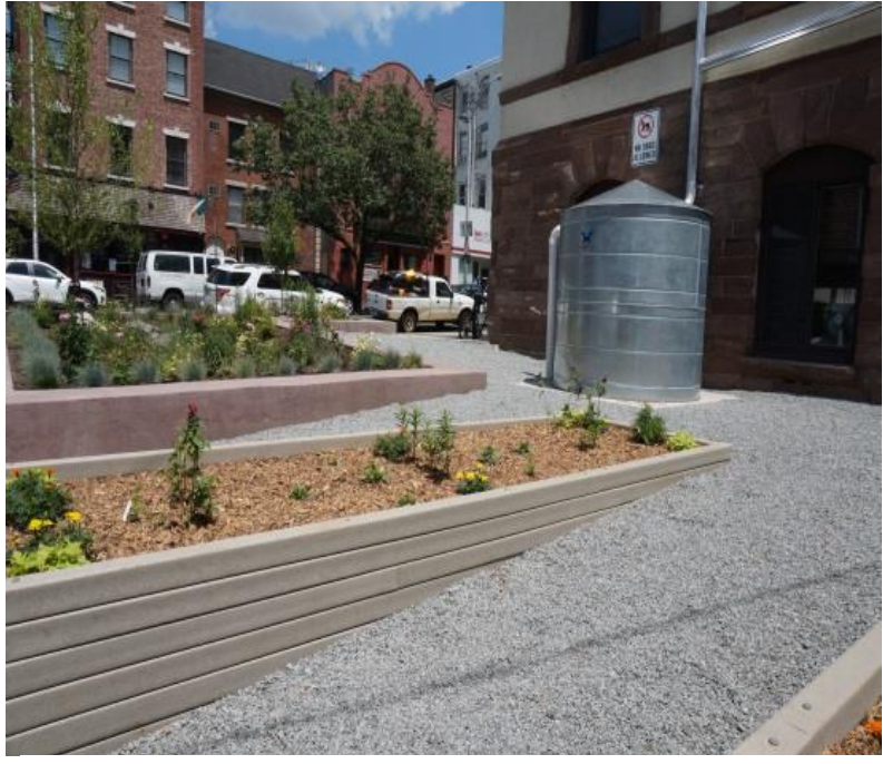
Green Infrastructure – Cistern / Rain Garden