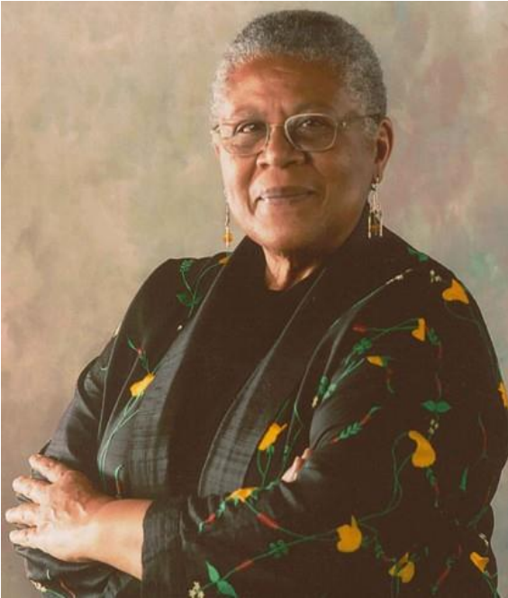
Minnijean Brown-Trickey Civil Rights Icon