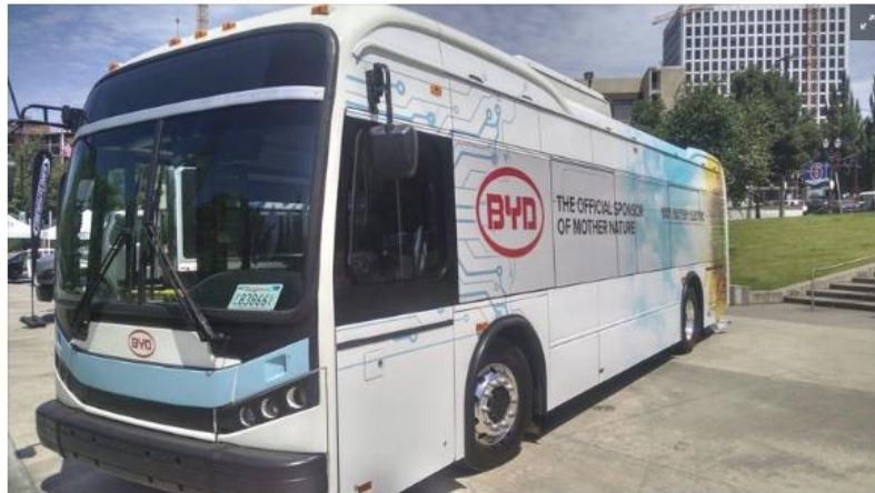
An electric bus from BYD at the EV Roadmap conference at the Oregon Convention Center this week.

Email Share in Share Tweet Save Print Order Reprints