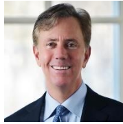
Ned Lamont Governor State of Connecticut