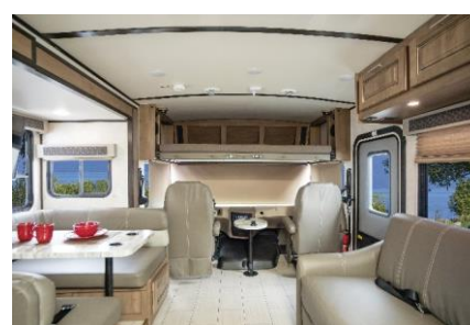
Pull down Bed View– AF34