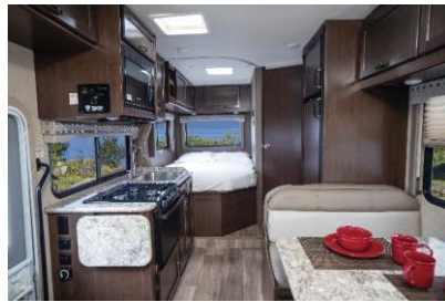
Kitchen – Dinette – Rear Bed – C25