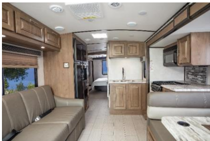
Lounge area, Rear Bed – AF33