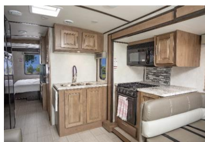
Kitchen Area – AF33