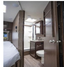
Bathroom (toilet, shower, sink) – C25