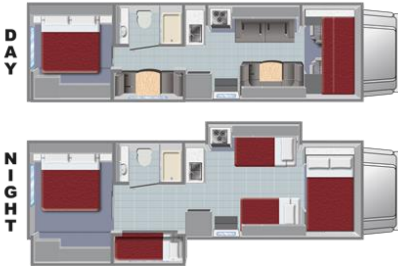
Example 31ft Slider floor plan