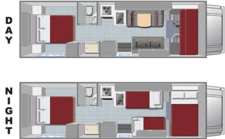
Example 28ft floor plan