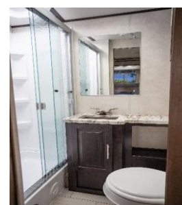
Bathroom – toilet - shower– AF34