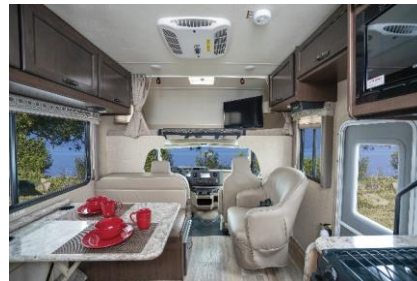
Cab-over bed – C25