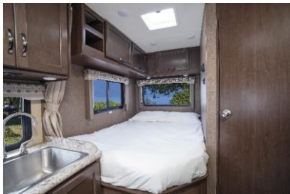
Rear Bed – C25

all product available as seen on our websites; layout differs by model, but indicative photos below