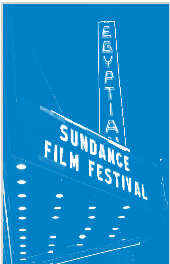
The Sundance Film Festival, a keystone event in the nation's film industry, attracts a global audience to Utah each year.

Another industry states have specifically targeted is the crafts industry. For example, HandMade in America in North Carolina —established in Asheville in 1993 with assistance from the North Carolina Arts Council—strives to make western North Carolina “the center for handmade objects in the United States” by encouraging and enabling product development among local craft artisans. 27 HandMade hosts a business boot camp to teach business planning, marketing, and entrepreneurship skills to artists. HandMade links more than 320 regional artists, crafts producers, bed and breakfasts, farm tours, restaurants, and other businesses through a 200-mile-trail system that is part of a larger tourism marketing campaign.