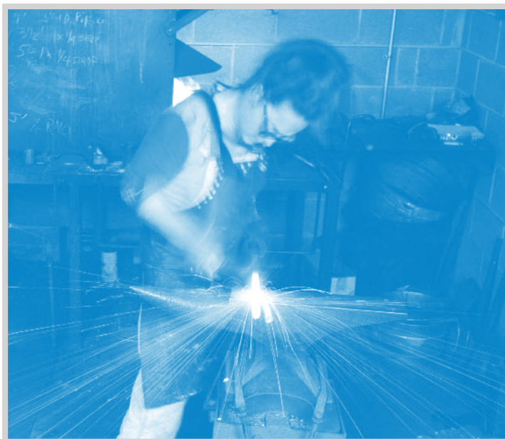
North Carolina's craft artists—including metal smiths, potters, weavers and woodworkers—create ceramics, textiles and furniture that make unique contributions to the state economy.

Fostering collaborations among businesses, nonprofits, and government can be yet another successful strategy for fostering arts business development. The Arts Enterprise Partnerships program of New Mexico , for example, stimulates commerce through business collaborations and artist training. 50 The New Mexico Arts agency supports rural partnerships among a cottage arts enterprise and at least two other partnerships, one of which must be a private business.