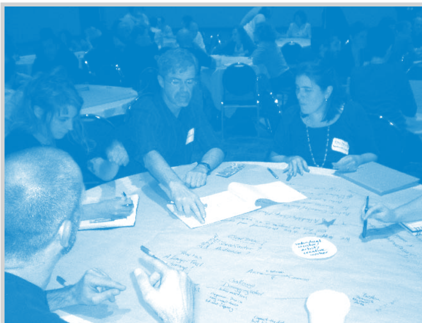
Rhode Island citizens map their cultural resources.

Identifying the right people to lead is critical to the success of planning efforts. A common strategy is to establish a special council, task force, or office charged with advancing the state's economy through the arts.