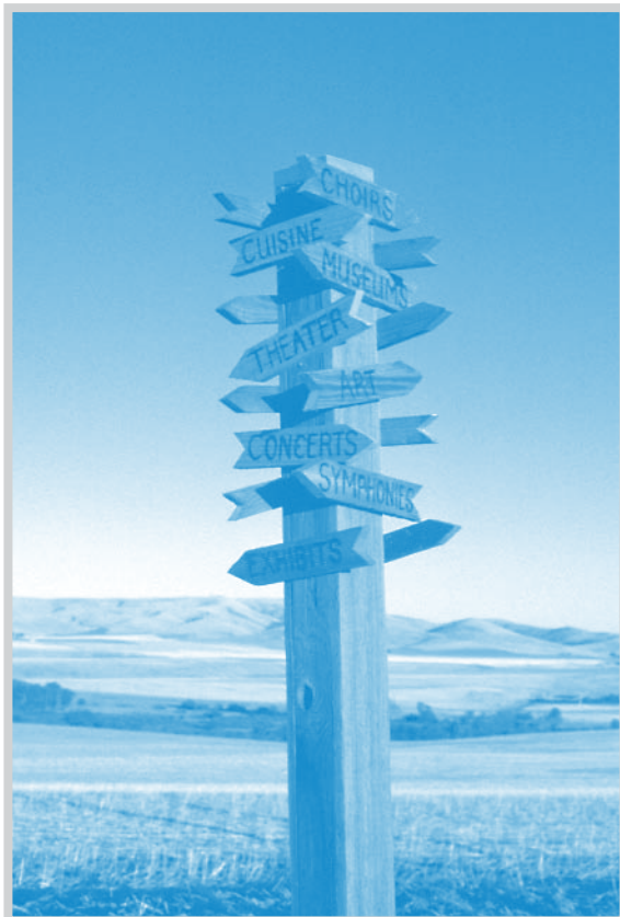
This signpost in Pendleton, Oregon, promotes many diverse art forms and cultural activities that contribute to the local economy.

This report outlines steps governors can take to incorporate arts and culture into state economic development plans and policies. Specifically, Chapter 2 addresses approaches for better identifying and analyzing a state’s arts and cultural resources so that state policymakers may better understand the existing creative enterprises in their state and the dynamic roles that these enterprises play in the state’s economy. Chapter 3 focuses on ways to incorporate the arts and culture into state planning policies. This often involves convening a strong leadership body comprising experts from public, private, and nonprofit sectors to develop a distinct vision for tying arts to economic growth strategies. Chapter 4 examines specific strategies states can take to implement their plans. Governors can develop the arts and culture sector through for-profit and nonprofit businesses, non-arts industries, individual entrepreneurs, and arts networks as well as through ensuring a skilled workforce for the sector to draw upon and education in the schools to cultivate understanding, appreciation, and demand for arts and cultural goods and services.