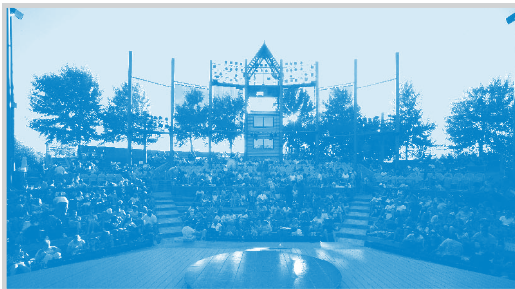
The Idaho Shakespeare Festival's performances, architecture and educational programs attract both residents and travelers.

These publications are available on the NGA Center Web site, www.nga.org/center .