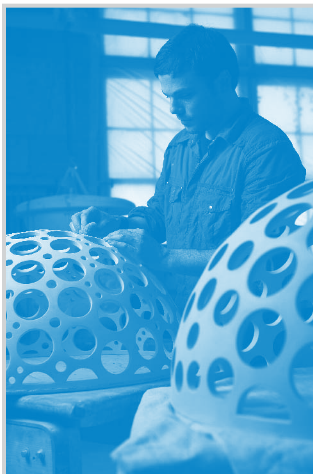
Kohler Arts Center arts/industry residencies in Sheboygan, Wisconsin, enable artists to explore new materials and production processes, often leading to innovations in Kohler's product line.

Located in Sheboygan, Wisconsin , the John Michael Kohler Arts Center Arts/Industry Residency Program represents another unique partnership funded by both the NEA and the Kohler Company, the nation's leading manufacturer of plumbing hardware. The program offers artists access to industrial technologies and facilities through long-term residencies, short-term workshops, and tours. The primary component of Arts/Industry is a residency program at Kohler Company, where artists have the opportunity to spend two to six months creating works of art using industrial equipment and materials—pottery, iron, brass, and enamel—and exploring forms and concepts not possible in their own studios. The Kohler Company, in turn, is given fresh ideas for its product lines. For example, Kohler's "Artist Editions" collection of surface-decorated plumbing fixtures grew directly out of the Arts/Industry program.