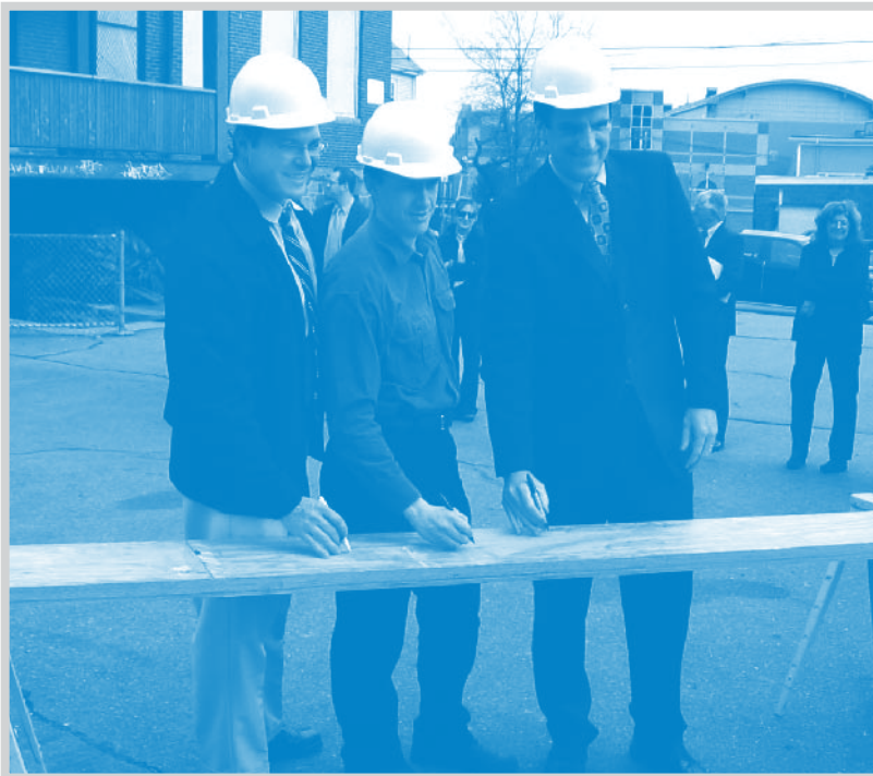
The groundbreaking ceremony for Keen Studios in Chelsea, Massachusetts, launched the conversion of a historic elementary school into artist live/work condominiums.

Formed in Minnesota in 1979, Artspace creates and preserves affordable spaces for artists and art organizations across the country. 77 Through development projects, consulting services, asset management activities, and community-building activities, Artspace works to support the professional growth of artists and enhance the cultural and economic vitality of communities. Every Artspace project has transformed an unused historic building into a fully functioning facility where artists can live, work, perform, exhibit, or conduct their businesses.