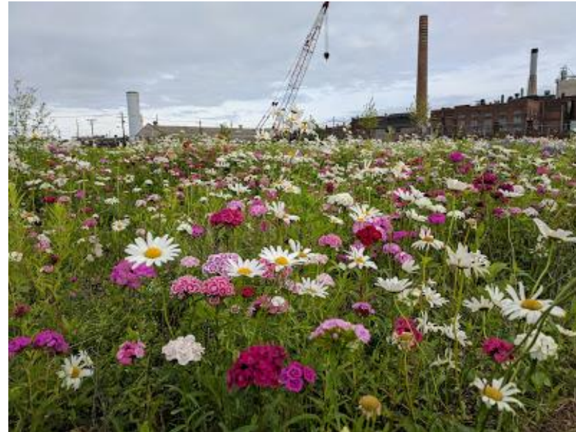
Camden County MUA - Phoenix Park (Green-CSO project)