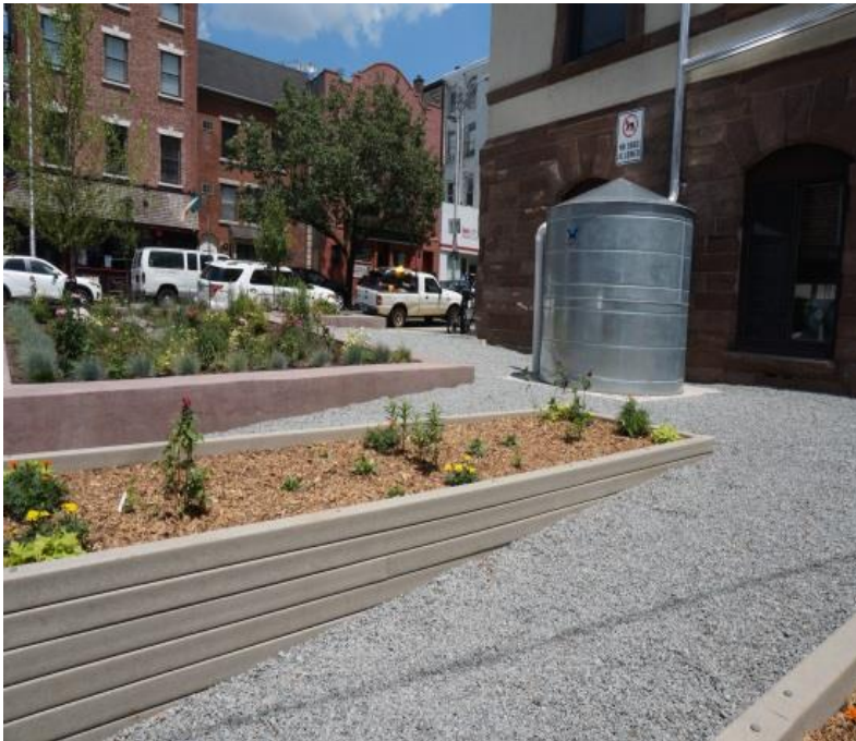
Green Infrastructure – Cistern / Rain Garden