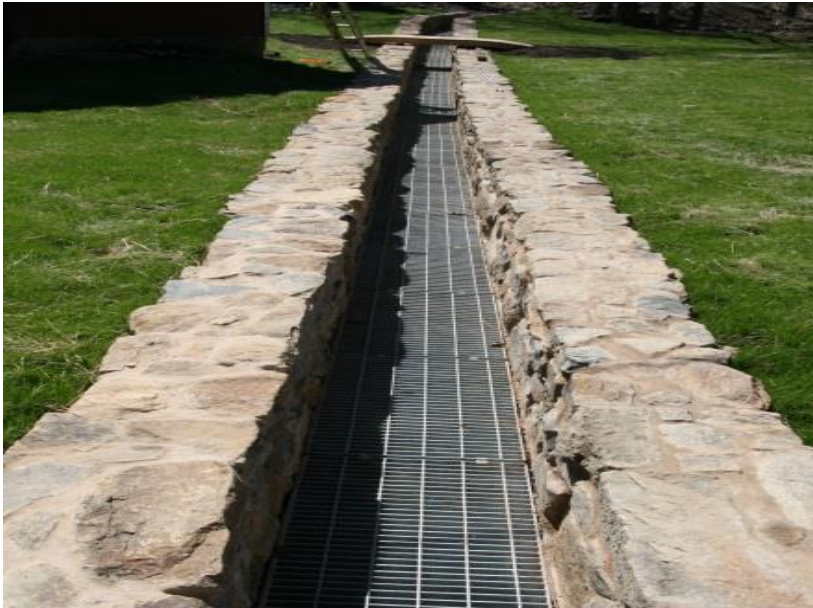
Storm Water Improvements