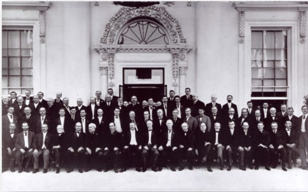
Photo: The first meeting of the nation's governors, convened by President Theodore Roosevelt in Washington D.C., 1908.

A 1908 meeting of President Theodore Roosevelt and governors led to the creation of NGA.