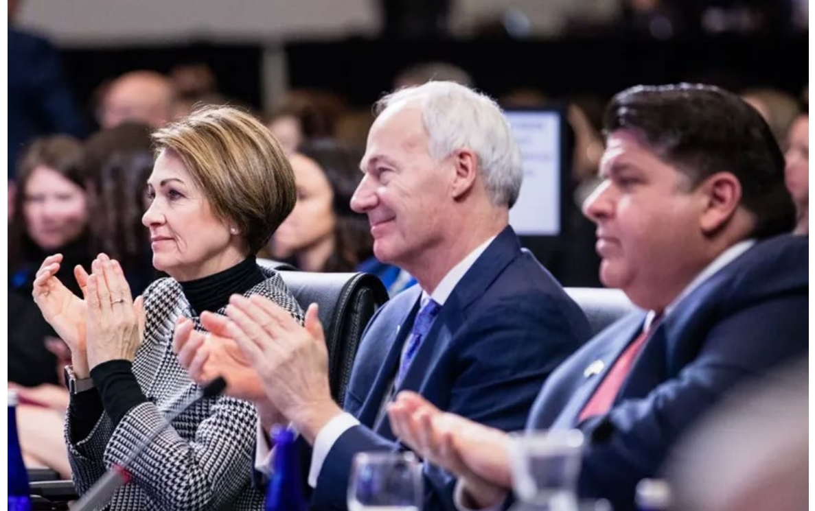
Photo: Governor Reynolds, NGA Chair Governor Hutchinson and Governor Pritzker at the NGA Winter Meeting in 2020.