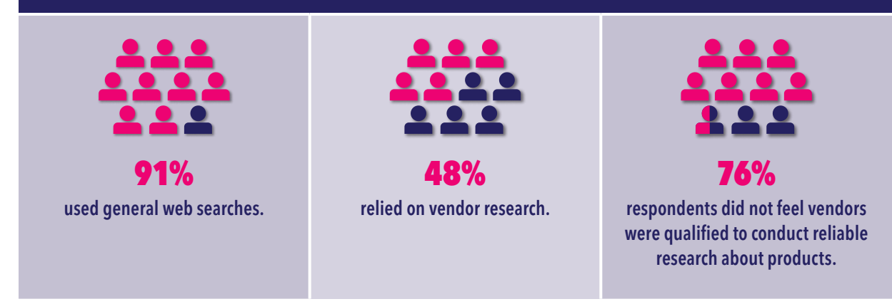
Based on the Education Research Perspectives Study sponsored by ISTE and Jefferson Education Exchange (JEX). More than 1,100 educators, district staff, school administrators and technology leaders from all 50 states were surveyed.

The survey also found that despite frequent use of vendor research as a basis for decision-making, a large majority of educators don't believe that vendors are well-equipped to conduct reliable edtech research.