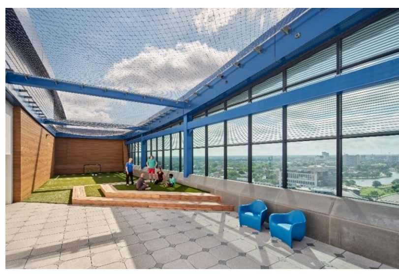
A rooftop area gives children a safe place to play basketball, along with other outdoor activities.

Other services, such as a primary pediatrics, sports medicine, laboratory and radiology services are also located in the building at 401 Gresham Drive to integrate mental health services with other routine services to de-stigmatize treatment of psychiatric conditions.