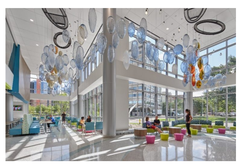
The interior of Children's Pavilion has artwork created by artists across the globe.

The opening of Children's Pavilion marks a pivotal point in CHKD history. CHKD launched a mental health initiative in 2018 to answer the growing community concern about a lack of pediatric mental health services in the Hampton Roads region and across Virginia. Since then, CHKD has brought together esteemed clinicians, researchers, and academicians from across the country to change the way young people receive mental health care.