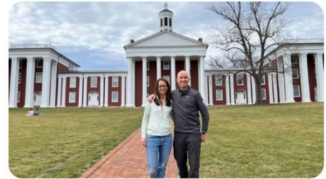
UTAH'S FIRST LADY ABBY COX IS JOINED BY GOV. SPENCER COX TO TALK ABOUT SOME LIFE UPDATES, THEIR RECENT TRIP TO ATLANTIC CITY, NJ FOR THE NATIONAL GOVERNOR'S ASSOCIATION AND THE IMPORTANCE OF BUILDING BIPARTISAN RELATIONSHIPS WITH OTHER GOVERNORS THROUGHOUT THE COUNTRY.

"Cox, 48, now serves as chair of the National Governors Association. Last month, he launched "Disagree Better," an NGA initiative meant to promote a more civil political discourse to solve some of the nation's most pressing challenges."