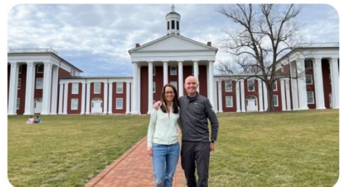
UTAH'S FIRST LADY ABBY COX IS JOINED BY GOV. SPENCER COX TO TALK ABOUT SOME LIFE UPDATES, THEIR RECENT TRIP TO ATLANTIC CITY, NJ FOR THE NATIONAL GOVERNOR'S ASSOCIATION AND THE IMPORTANCE OF BUILDING BIPARTISAN RELATIONSHIPS WITH OTHER GOVERNORS THROUGHOUT THE COUNTRY.