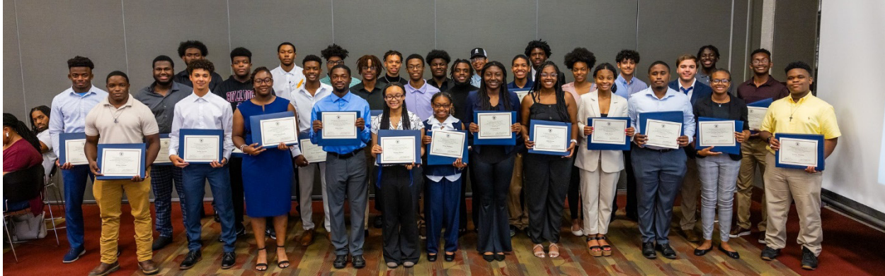
Mississippi State University Bagley College of Engineering 2023 Summer Bridge Participants

opportunities for high-achieving, underrepresented minority college students pursuing careers in engineering. When those barriers can be removed, engineering students are better able to adjust to a new learning and living environment and persist through their first year increasing the probability of timely graduation rates.